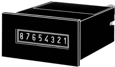
Standard Clip Mounting